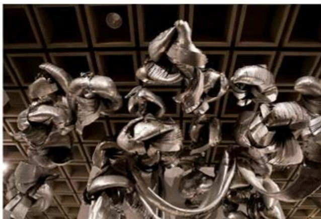
"Living Sculpture," in aluminum sheeting, by Marisa Merz.

And she's nobody's consort. "Marisa Merz: The Sky Is a Great Space" explores a 50-year career, belatedly lifting Ms. Merz from the edges of this all-male trend — whose advocates did not always include her in its first, reputation-building exhibitions in the late 1960s and early '70s — to its throne.