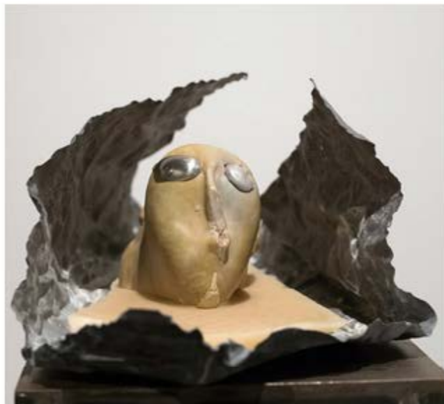
"Testa (Head)," a sculpture by Ms. Merz, a leader in the Arte Povera movement.

The show looks great, the first completely confident effort in the Marcel Breuer landmark since the Met took it over from the Whitney Museum barely a year ago. On view are more than 100 works, including a few often-delicate installation pieces that represent the large sprawling ones (mostly lost) that dominated the early years of her career.