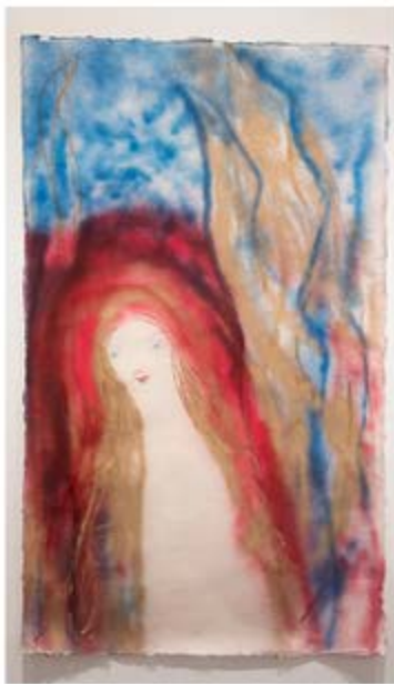
An unframed painting from "Marisa Merz: The Sky Is a Great Space."

Ms. Merz, who continues to work in her Turin studio, has remained truer to the movement's vow of poverty, opting for copper wire, paraffin, scraps of wood and cardboard throughout her career (although she does have a penchant for gold leaf). She seldom resorts to outside fabrication, with its aura of expense, except for the plain iron pedestals that hold many of her small heads of unfired clay. Otherwise, she prefers to keep her hand in, making everything herself. Another boon is her devotion to drawing, which wends through her habitual mixing of mediums, giving this exhibition a sense of fullness and intimacy that few in her cohort can muster.