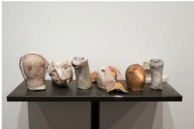
Sculptures by Marisa Merz.

Small sculptures knitted from either wire or nylon thread resemble primitive slippers, bowls or toy boats that might have been excavated from an archaeological site. Ms. Merz also made "Bea," knitting her daughter's name in soft, cloudlike letters that have a touching vulnerability, their knitting needles still attached.