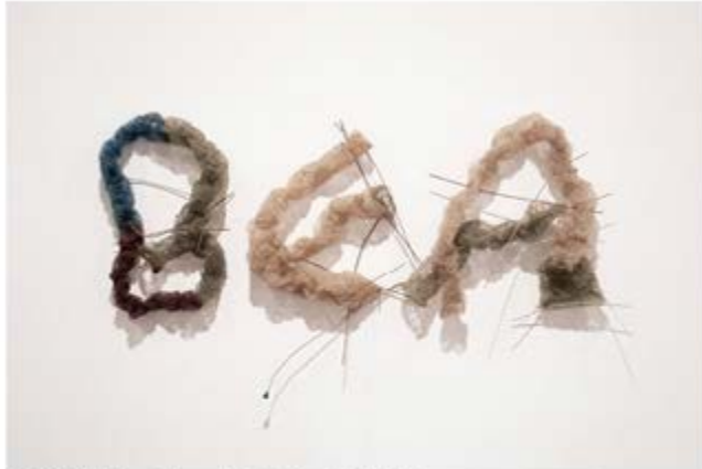
"Bea," Ms. Merz's daughter's name, knitted, with needles included.

The domestic-industrial duality continues on a smaller scale in the exhibition's largest gallery, where many pieces, dating from late 1960s and 1970s, incorporate little squares and triangles Ms. Merz knitted from copper wire. Delicate and gleaming, these are nailed to walls, evoking boxy little stars, or to found objects (an ancient door, a stool) forming quilt-like patterns and padding.